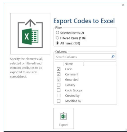
Figure 3: Exporting codes and related information to Excel

In the following dialog, select All items and activate the options Code and Grounded . 'Grounded' displays the frequency count for each code. 'Density' shows the number of links between codes. If you have linked some codes already, you can also activate this option. If you have written code comments, also select this option